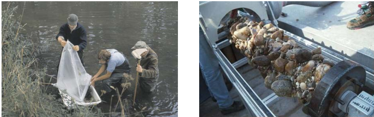
Fig. 4 Data-collection to describe ecologic conditions prior and past evacuation measures: Sampling of fish and small organisms (left), freeze core to gain grain size distribution of river bottom (right)

Analysis has to cover hydrology, hydraulic conditions, morphology, floodplains and meadows, chemistry, organisms, structure of habitats, etc. and needs time-consuming data collection ( Fig. 4 ). To be able to estimate the intensity of disturbances the data-collection has to be performed prior to the foreseen measures as well as following the evacuation action.