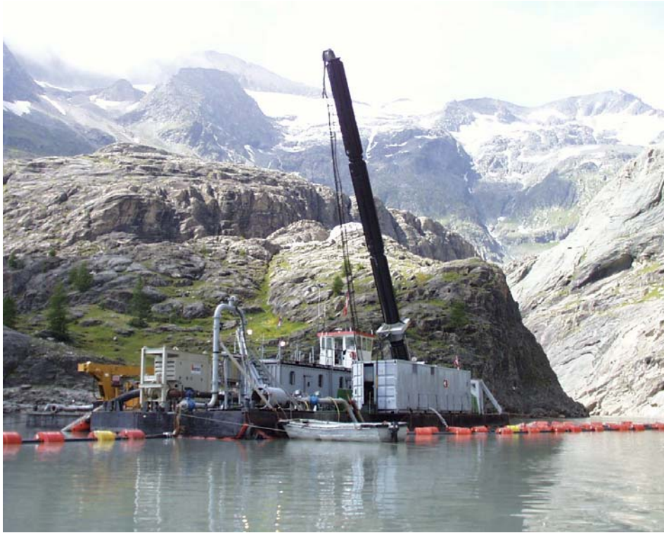
Fig. 3 Water injection dredger at Lake Margaritze (Austria)