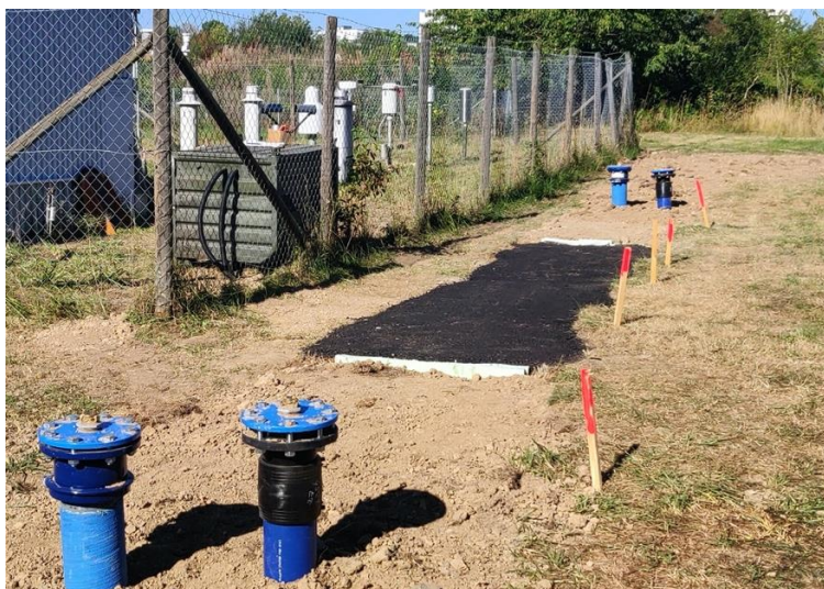
Figure 1: View of our test field with the weather station, from which we use hydro-meteorological data, in the background.